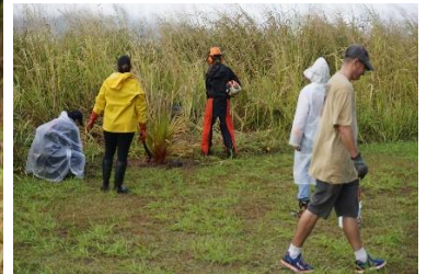
Nā Lālā O Ka Pūhala...Mahalo